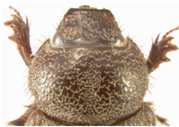
Fig. 2. Pronotal sculpturing of P. costalimai .