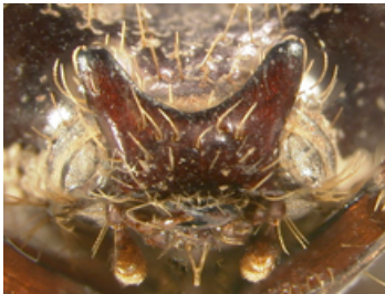
Fig. 1. Head (frontal view) of male P. costalimai showing bifurcate clypeus.

1'. Clypeus not reflexed in males or females. Pronotum and elytra not as above..... 2