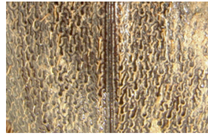
Fig. 3. Elytral sculpturing of P. costalimai .

2(1). Labrum semicircular, exerted beyond clypeus. Mandibles with external, lateral lobe (Fig.4) ..... Aegidinus Arrow