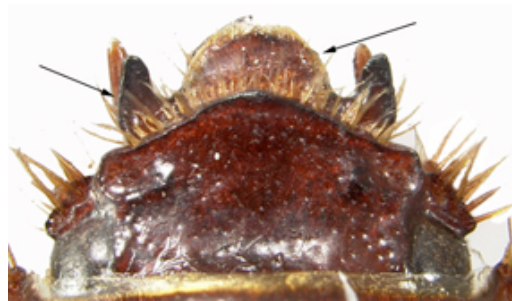
Fig. 4. Head (dorsal view) of Aegidinus sp. Arrow on right points to labrum, arrow on left indicates mandibles.

2'. Labrum not exerted beyond clypeus. Mandibles without external, lateral lobe ..... 3