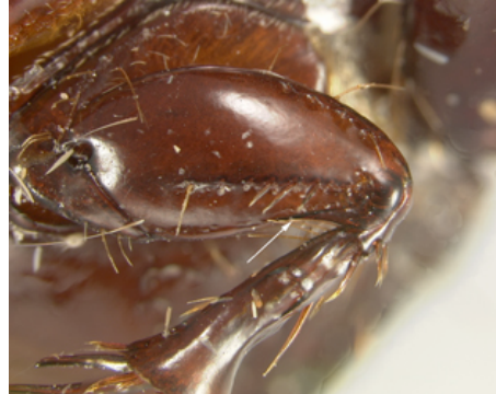
Fig. 6. Mesofemur (ventral view) of Aegidiellus alatus . Arrow indicates absence of ridge.

URL: http://www-museum.unl.edu/research/entomology/Guide/Scarabaeoidea/Scarabaeidae/Orphninae/Orphninae-Key/OrphninaeK.html